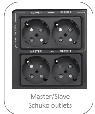
Master/Slave Schuko outlets